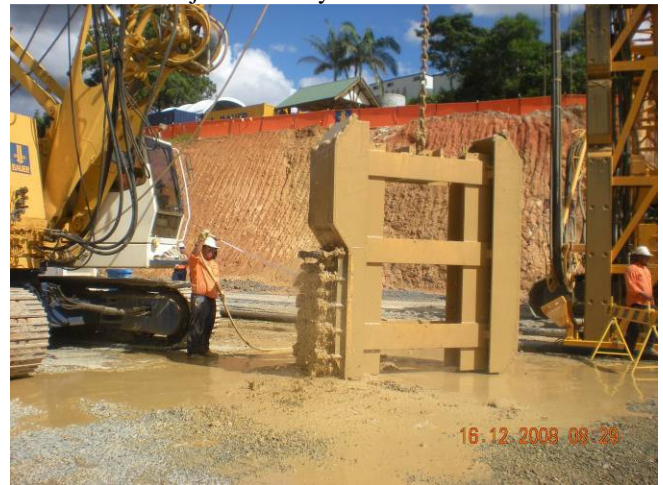
Plate 5 – Cleaning Brush for Joints

This method proved to be very successful. A number of joints were exposed following completion of the wall, the quality of the joints meant that it was typically difficult to detect where the joint actually was.