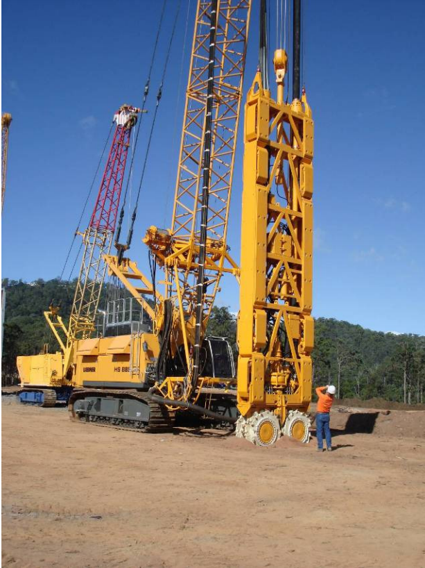
Plate 2 – General View of Cutter

The 830 mm thick wall was constructed in an alternating sequence of primary and secondary panels. Primary panels consisted of 3 bites for a combined total of 7m length. Secondary panels were excavated once the adjacent primary panels were complete. The secondary panels were 2.8m long and were overcut into the plastic concrete of the adjacent primary panels. During excavation, the sides of the excavated trench were supported by a bentonite slurry. Upon completion of excavation of a panel, low strength plastic concrete was poured into the trench using the tremie method. As the concrete level in the trench rises during placement, excess bentonite is drawn off and pumped to the plant station for treatment and re-use.