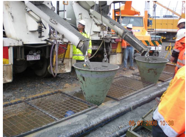
Plate 6 – Concreting of Primary Panels

The concrete was over-cast at ground level to ensure that all contaminated concrete (in contact with the bentonite) had been removed.