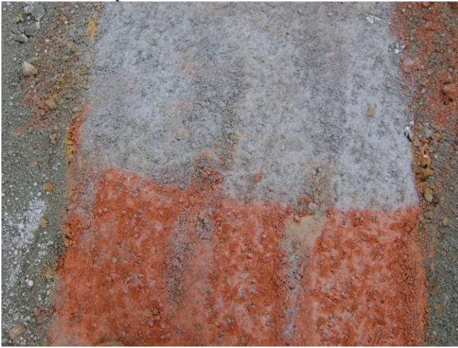
Plate 9 – View of joint between primary and secondary panels

inspection of the joints within the wall. It was typically difficult to detect the position of the joint which indicated that the cleaning process was effective in removing any excess bentonite. The quality of the joints can be seen in Plate 9 which shows the joint between a panel with dyed concrete and a panel without.