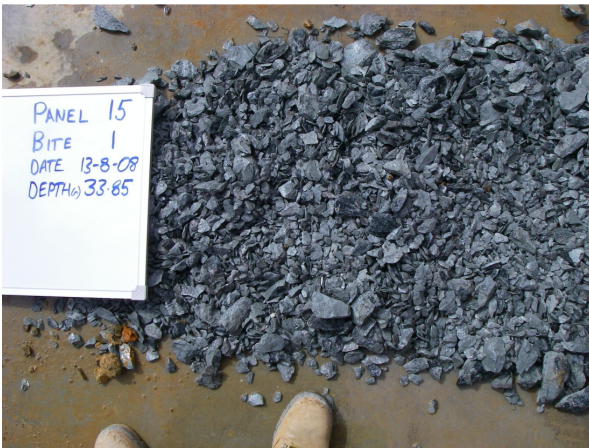
Plate 10 – Typical sample in slightly weathered to fresh greenstone

A critical aspect of the construction of the COW was ensuring that the base of the wall was sufficiently socketed into slightly weathered to fresh greenstone or greywacke to ensure no seepage paths could develop beneath the wall. The arrangement of the desanding plant was such that samples could be taken by placing an excavator bucket beneath the discharge point for the larger cuttings. This gave large high quality samples for assessment as shown in Plate 10. Once the samples were observed by the HDA geologist to have none or minimal traces of weathering in the rock then the excavation would continue for an additional 0.5m to ensure the panel was socketed into rock.