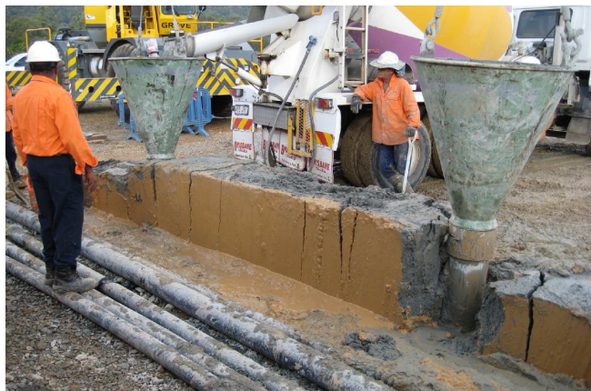
Plate 7 – Panel 25 Concrete Pour

It was determined that it was the concrete from the initial trucks that gets pushed to the surface of the panel. This effect can be seen in Plate 8 where the red dyed concrete from the initial trucks is clearly apparent above the later non dyed concrete.