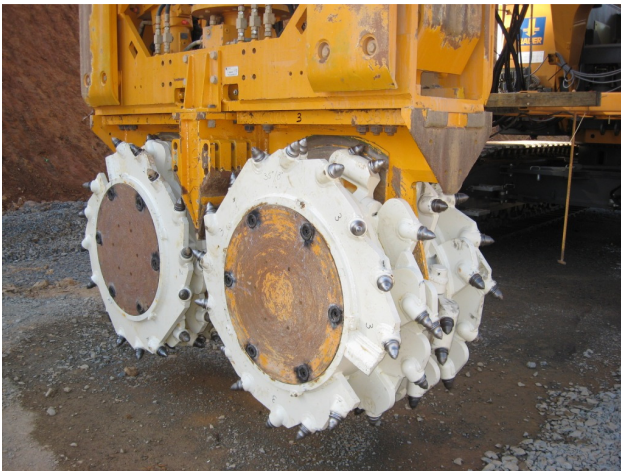
Plate 3 – Cutter Wheels with Rock Teeth