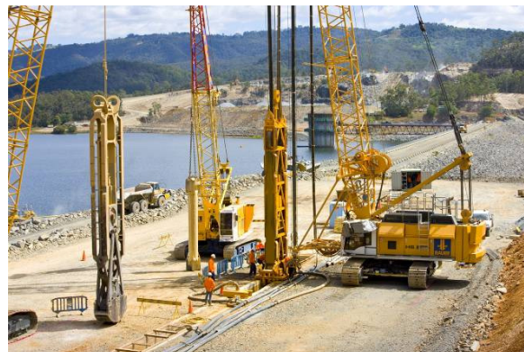
Plate 1 – General View of COW Operation

Construction of the 220m long and up to 53m deep Cut Off Wall (COW) was commenced by Bauer Foundations Australia (BFA) in May 2008 and was completed in January 2009 approximately six weeks ahead of schedule. The wall was excavated from ground level using a combination of "clamshell" grab and hydraulic trench cutter. When higher rock strengths were encountered, a chisel was used to assist in breaking the rock for excavation. A general view of the excavation operation is shown in Plate 1 and a view of the trench cutter is shown in Plate 2.