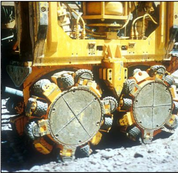
Plate 4 – Cutter Wheels with Roller Bits